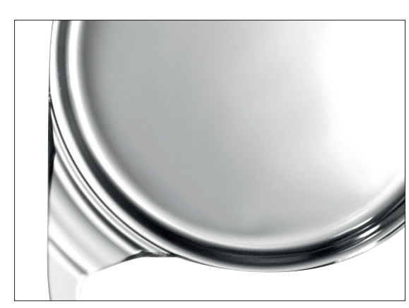
Figure 1. Schematic illustration of the CT LUCIA 621P optic-haptic junction

Unfolding of the CT LUCIA 621P IOL in the capsular bag is facilitated by its heparin-coated surface.* Yet, the lens unfolds in a gentle and controlled manner that enables its positioning. The sophisticated optic-haptic junction with its relatively rigid and enlarged step-vaulted haptics socket (Figure 1) together with the length and biomechanics of the haptics act to maintain stable IOL centration.